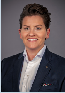
Kali Clark Mayor